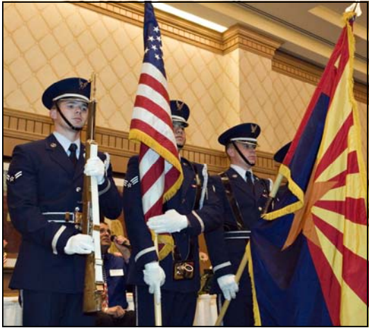
Honor Guard from Luke Air Force Base

Here are a few highlights in pictures of the 31st Annual Barrier Buster Luncheon: